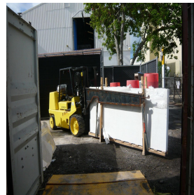
石材吊具 Marble Lifter

可让司机用同一台叉车同时搬运近或远的货物，非常适合长形状的石材装卸。 Hydraulic Jib Attachment makes driver can use the same forklift truck to carry the goods near or far simultaneously, which is suitable for loading and unloading long shaped stone.