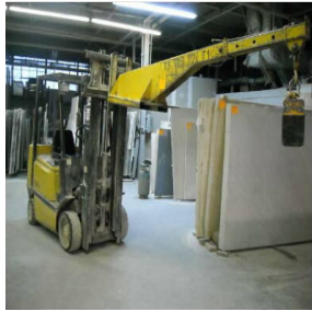
机械吊臂 Mechanical Jib Attachment

Forklift Attachments Used In Marble Industry