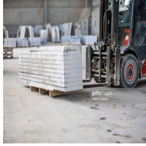
大吨位调距叉 Heavy-Duty Fork Positioner

起初为将货物吊高而设计，该属具常用于石材玻璃行业。 Jib Attachment was designed for lifting goods originally. This forklift attachment commonly used in the stone /glass industry.