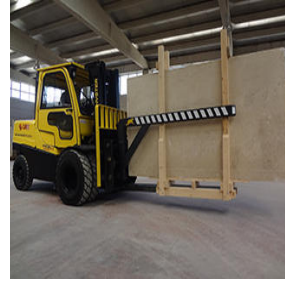
石材搬运器 Marble Handler

用于处理不同托盘尺寸的搬运，石板过于长，需要更宽的调距叉来搬运。 Heavy-Duty Fork Positioner was commonly used for handling pallets of different sizes. It needs a wider fork to carry if slate is overlong.